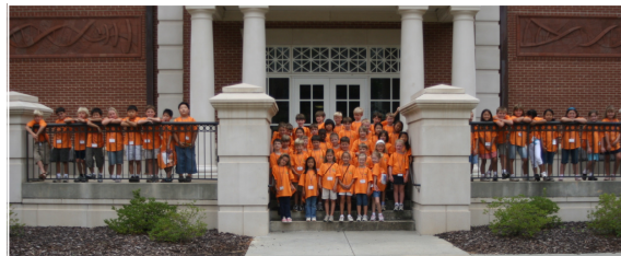
Summer Y.E.S. participants display their camp t-shirts on the last day of each of the camps.